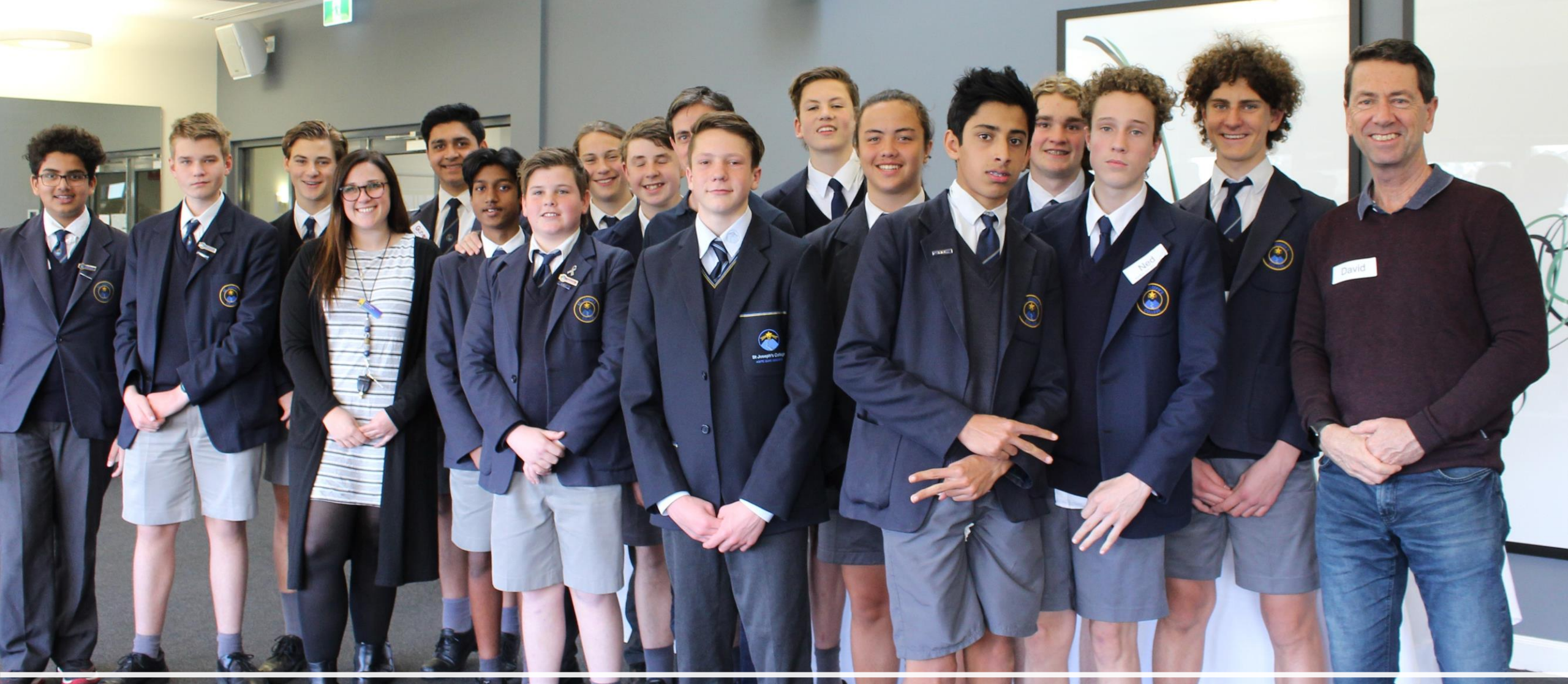
Creating the Smart Generation Committee at St Josephs College, 2019