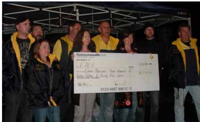
Southern Street Machiners presenting the cheque to Halcyon staff

Halcyon plan to have a display board and brochures ready for the new season in October and propose to have staff plus the band present at every cruise night.