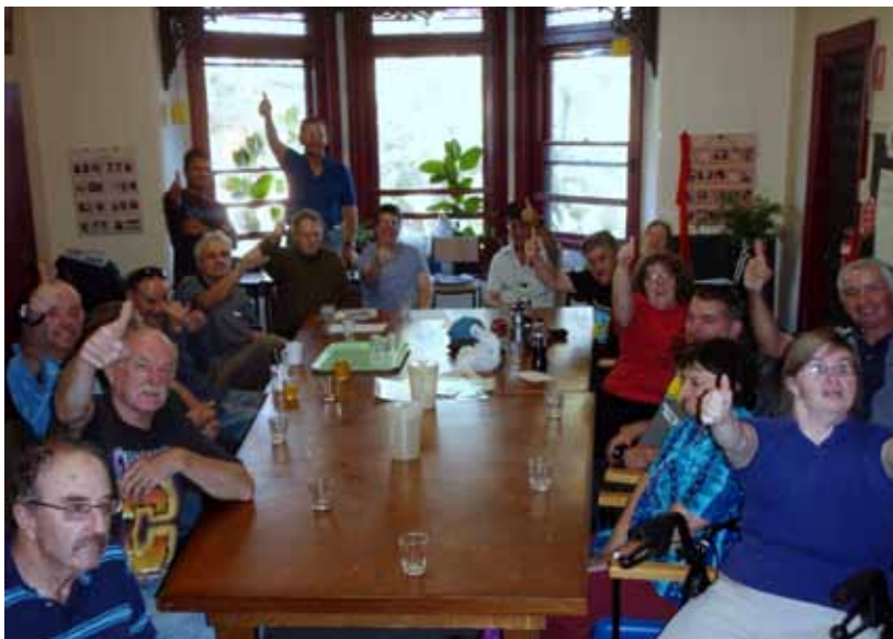
Celebrating 21 years of self advocacy